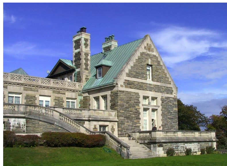
Arden Villa, Orange County, New York